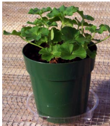
Figure 2b. Saucer for pots.