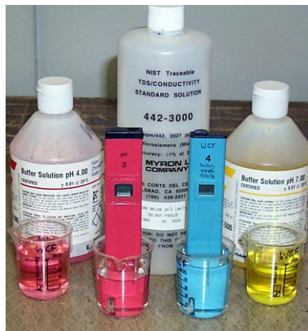
Figure 2g. Calibration standards for testing.

5. Calibrate your pH and EC meters prior to testing (Fig. 2g). The test results are only as good as the last calibrations. Calibrate the instruments every day that they are used. Always use fresh standard solutions. Never pour used solution back in the original bottle.