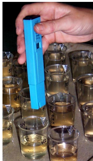
Figure 2h. Testing leachate samples.

6. Measure pH and EC of your samples (Fig. 2h). Test the extracts as soon as possible. EC will not vary much over time provided there is no evaporation of the sample. The pH will change within 2 hours. Record the values on the charts specific to each crop.